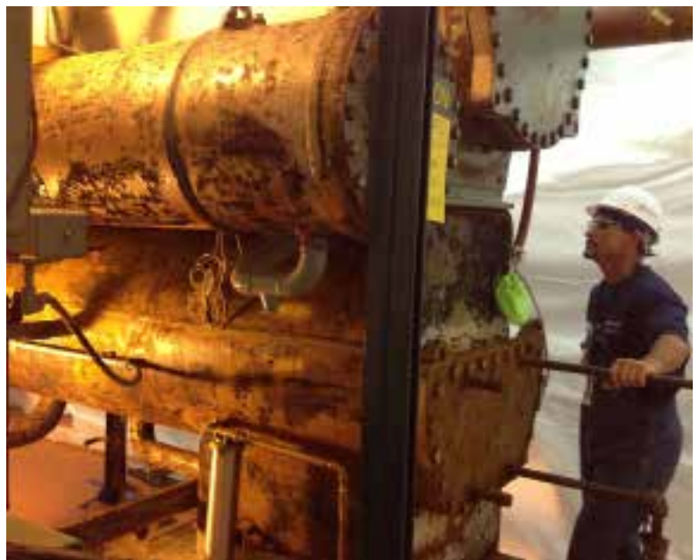
PMT Supervisor looks over initial demolition of Carrier 19FA chiller undergoing piping and component upgrade.