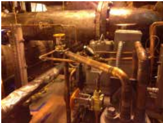
New Components Installed: Liquid Level Gauge, Swagelok Valves, Pump Down Unit, Copper Piping and Supports