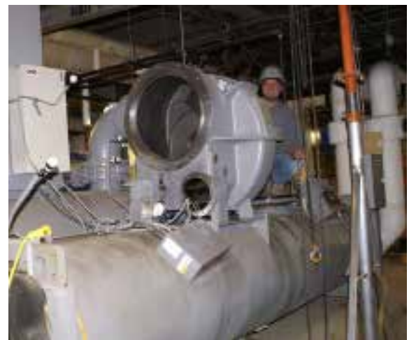
PMT Service Technicians perform field inspection and repair of a Carrier 19FA centrifugal chiller.