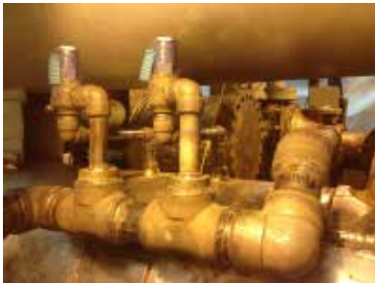
New Hansen relief valve and relief valve exhaust piping installed.