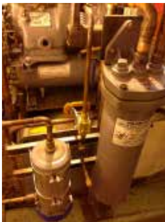
Relocated new filters on outboard side of unit for ease of future maintenance.