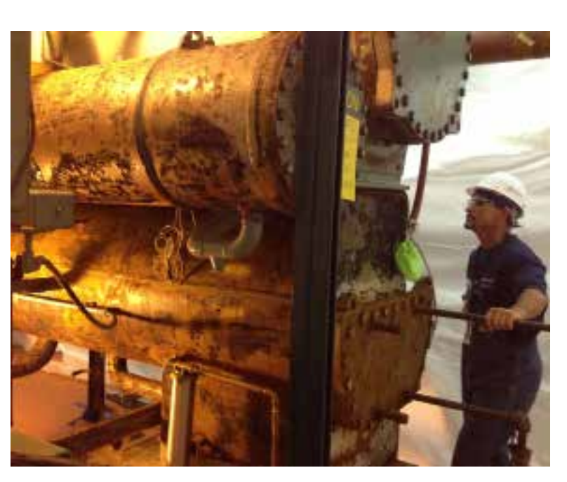
PMT Supervisor looks over initial demolition of Carrier 19FA chiller undergoing piping and component upgrade.