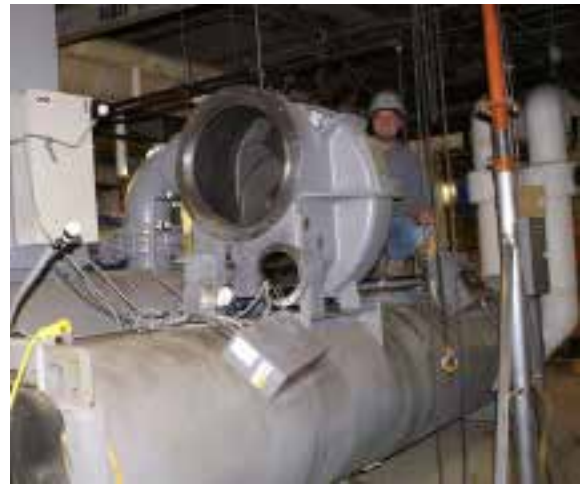
PMT Service Technicians perform field inspection and repair of a Carrier 19FA centrifugal chiller.