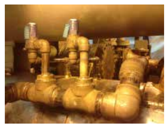
New Hansen relief valve and relief valve exhaust piping installed.